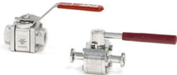
/ HYGIENIC / HIGH PURITY BALL VALVES