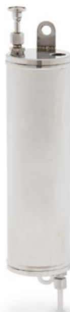
/ SAMPLE COOLERS