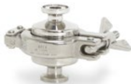
/ CLEAN STEAM TRAPS