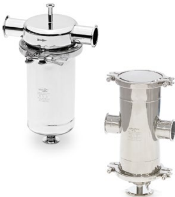
/ STEAM HUMIDITY SEPARATORS