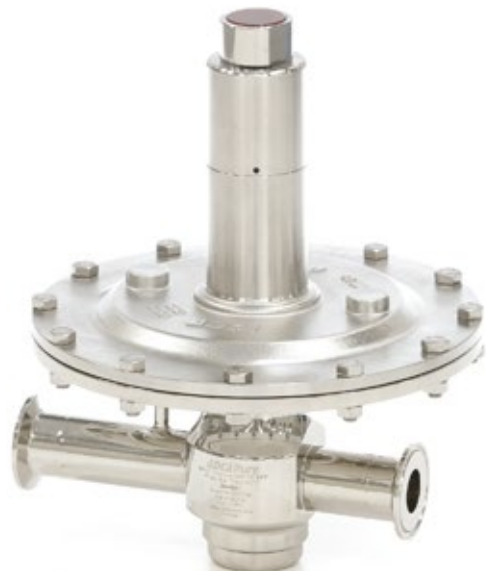
/ LOW PRESSURE BLANKETING AND VENTING REGULATORS