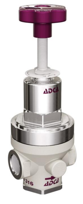
PS31SS 1/2" - DN 15